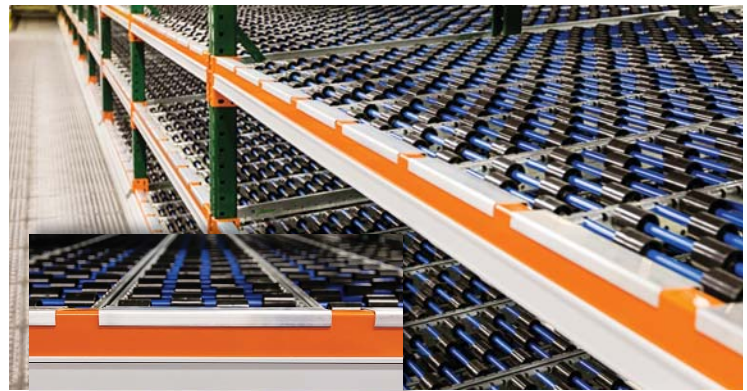
UNEX developed this unique label holder for Flow Bed lanes because stock can change so quickly at Pine State Trading Co. The labels allow order pickers to clearly see which items are stored in various lanes, and the labels can be switched out easily as SKUs change.

Products were shipped on time, materials were well-packaged and easy to unload. "UNEX delivered as promised," says Steve. "Now, if our sales reps come to me with a new product line for our customers, I have the space and the flexibility to turn things around quickly."